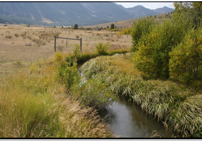
Riparian habitat improvement after fencing on Duck Creek