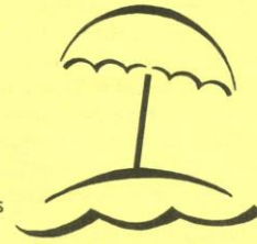
Up came the bright rainbow colored umbrella

This poor fellow experienced the one thing we all live in fear of.... Hooking ourselves in the face! Well, actually it was his ear. I didn't have the heart to mention it was the stylish thing for guys to do these days, only his shot was a little off from the normal earring position. No one wants to hear (this is true) you can damage the nerves in the side of your face, if the piercing touches a nerve. As you can imagine, there was great discussion, a little beer for the patient, plans of approach, a little more beer for the patient, more discussion, more beer - you get the idea. The decision was made, the removal would be by means of pushing the hook threw the cartilage then breaking the barb off so the hook would slide out easily. The patient took another big swallow of beer, taking a good hold of a supporting post the "doctor" then proceeded with "surgery". What a lucky guy! After all the deliberation it was discovered the hook had only pierced the skin covering the cartilage. Wouldn't you know, the skins the painful part! I don't think I've seen anyone turn so red in the face! The "operation" was a success, with photos plastered on the Staley's poster board to remind all "beware in the wind"!